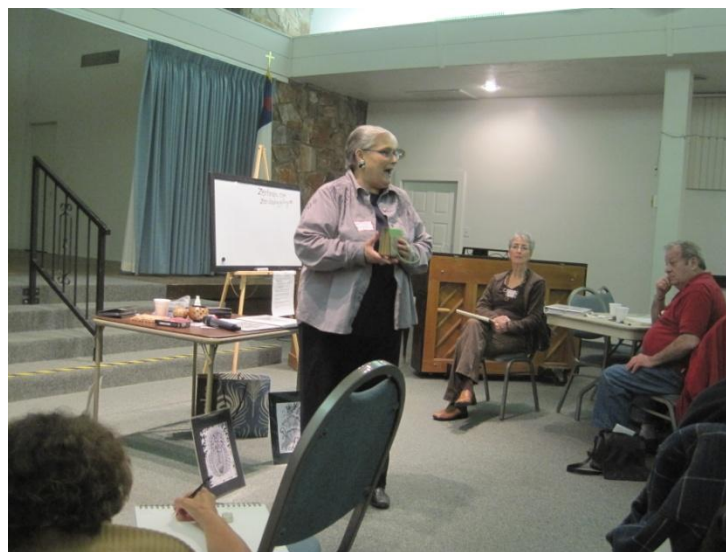
Betty Lake on Zentangle drawing.

For ART BEAT 1-time ads contact Karen 602-803-0931 karen_m_lockhart@cox.net