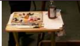
The Limited Palette

At our next Feb 1 st Meeting REMEMBER IT IS TIME TO BRING in THOSE