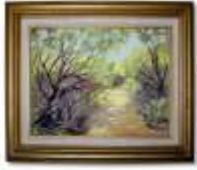
Barbarann Mainzer "Tread Lightly"